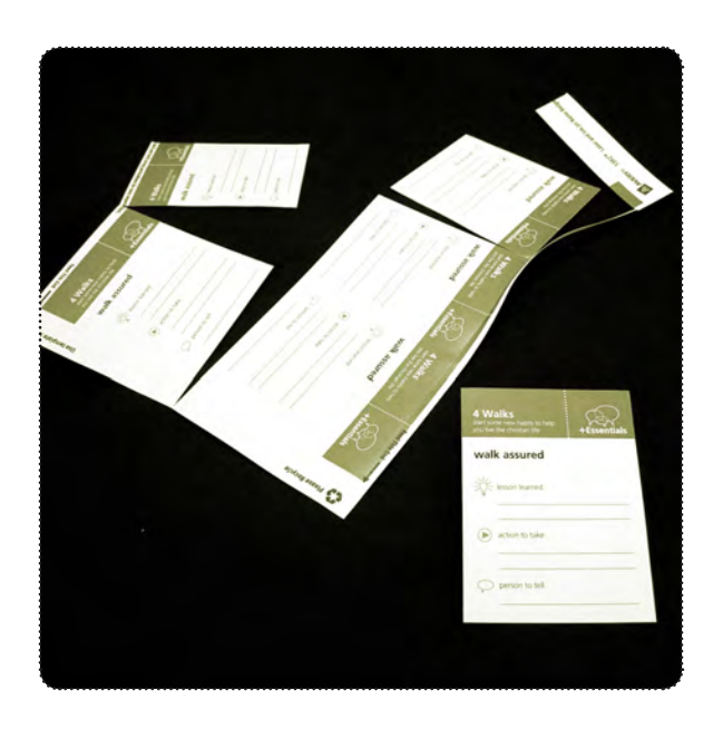
Fold and separate cards along perforations and give to each group member.