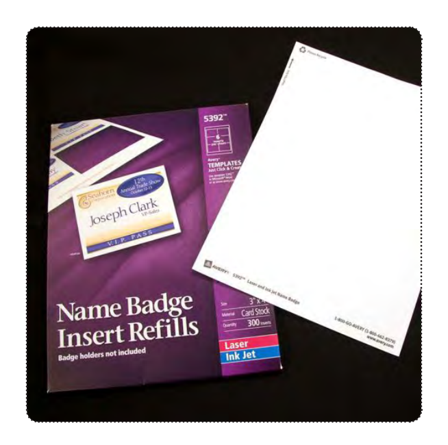
Feed Avery® 5392™ perforated name badge insert (available at office supply stores) into your ink jet or laser printer.