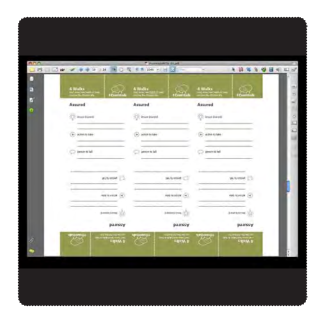
Go to a Mini-Journal card template in this document and print. There are six cards per sheet. To achieve proper alignment to the template, SET PAGE SCALING TO NONE in the print dialog box!